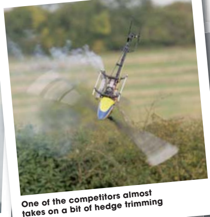
One of the competitors almost takes on a bit of hedge trimming