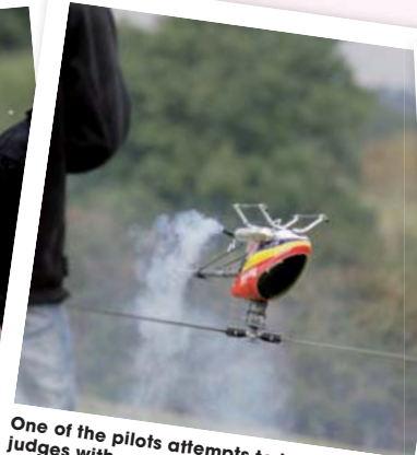
One of the pilots attempts to impress the judges with some close-up 3D action