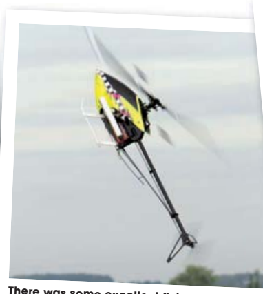
There was some excellent flying in both groups over the two days