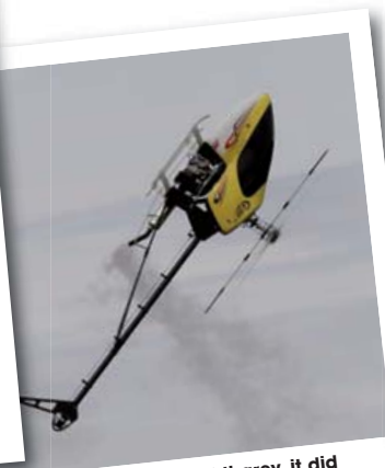
Although the sky was a bit grey, it did stay dry throughout the competition