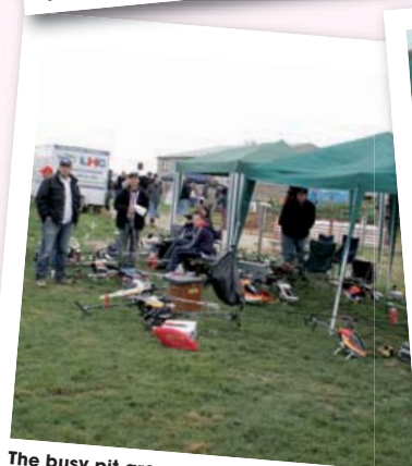
The busy pit area